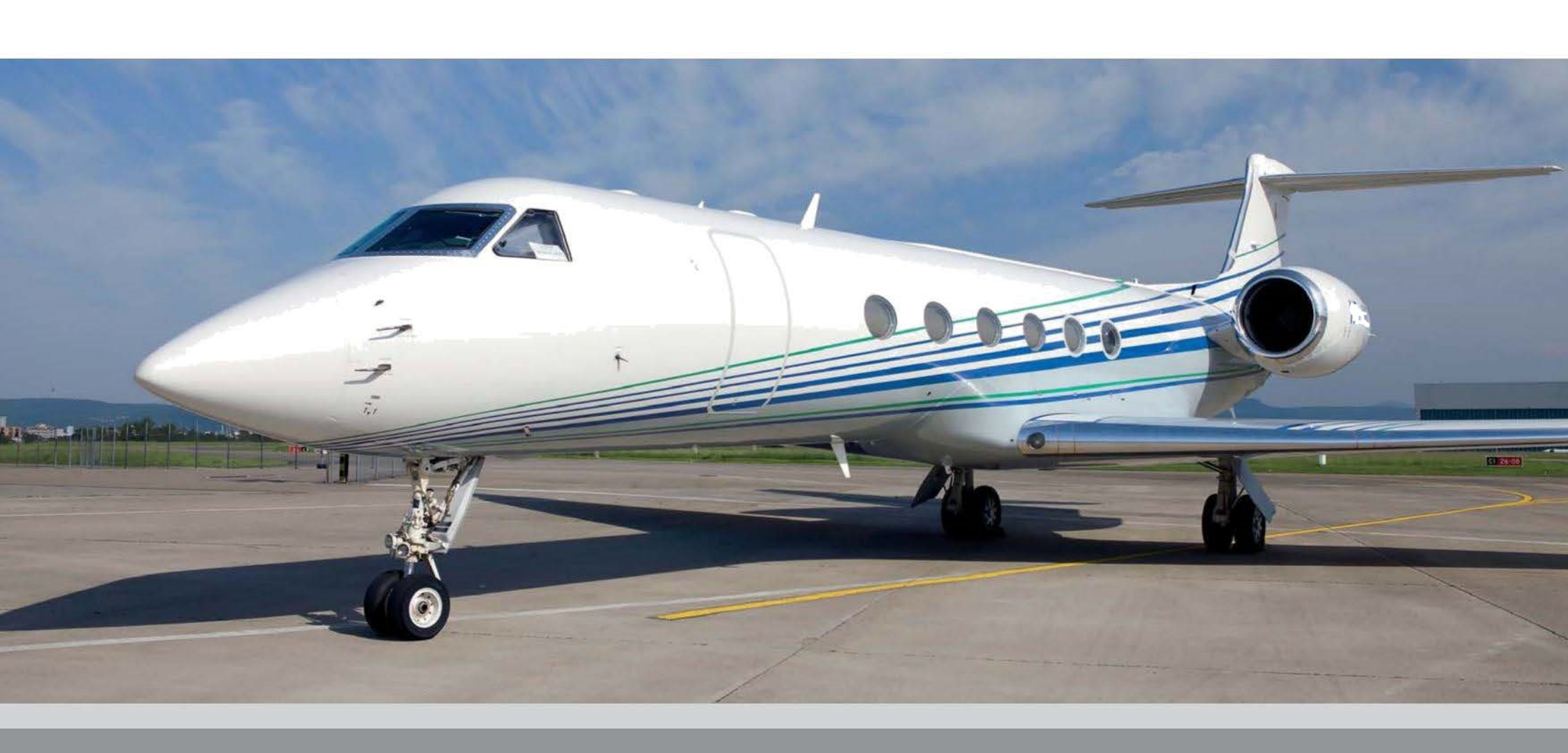
1999 Gulfstream GV